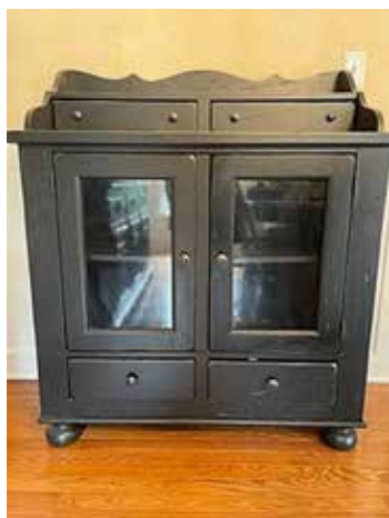
CREDENZA / CABINET / CHEST 18dx-42wx49h - $130 908-635-1190

MEDICAL EQUIPMENT Upbed -Asking $3,000; wheelchair- $100, stairlift-$2,000; Hospital bed-$200. OBO for all items. 908-213-0394